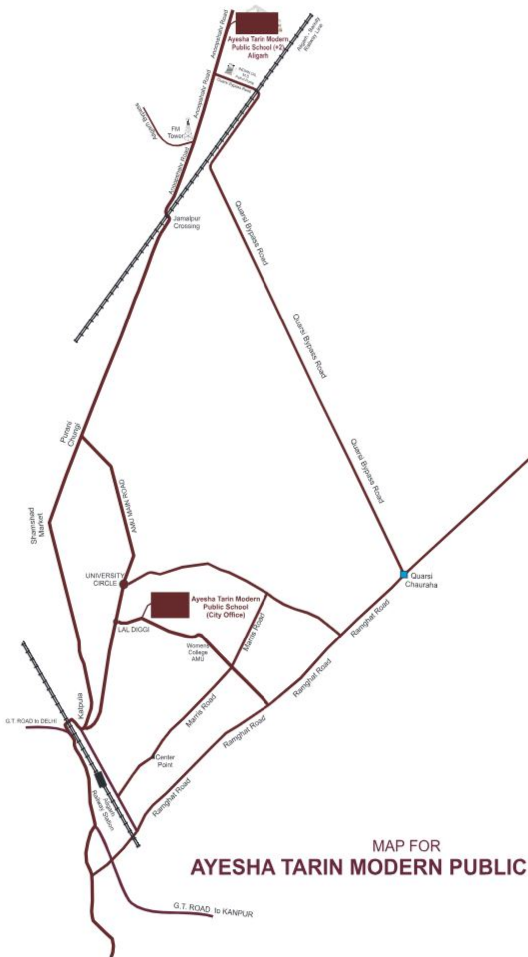
MAP FOR AYESHA TARIN MODERN PUBLIC SCHOOL